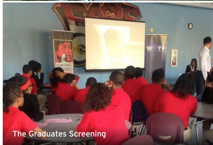
The Graduates Screening