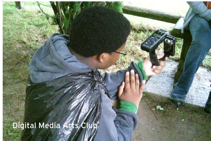
Digital Media Arts Club