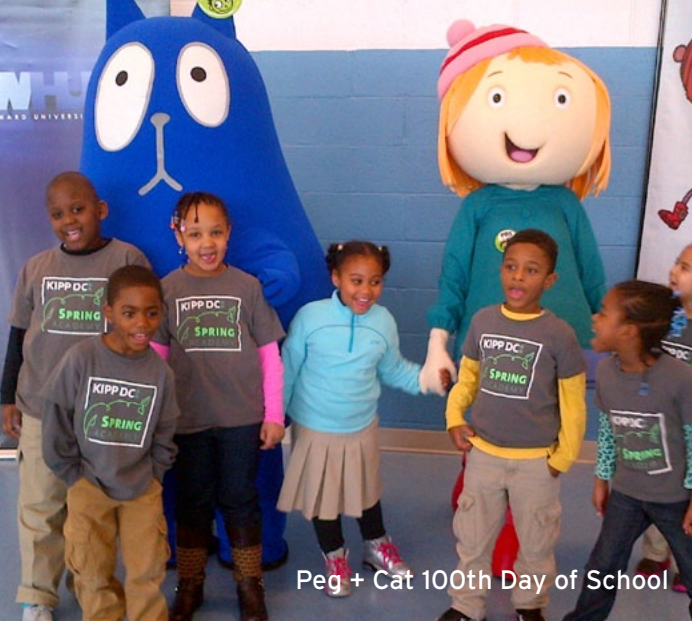
Peg + Cat 100th Day of School