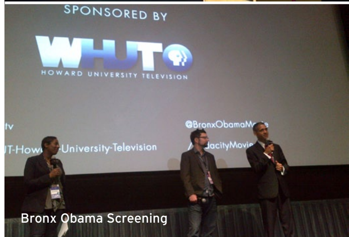
Bronx Obama Screening