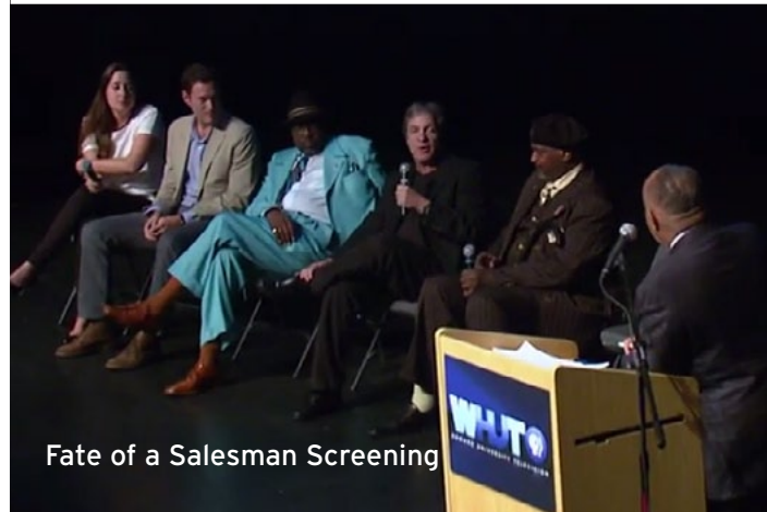
Fate of a Salesman Screening

WHUT and CentroNia held a screening of Latino American Video utilizing OVEE online. The viewing was followed by a moderated conversation. The event featured clips from the documentary Pride & Prejudice-Latino Americans Civil Rights Then & Now, which explored the life and times of Cesar Chavez, Dolores Huerta, The Capo Family and The Los Angeles Walkout.