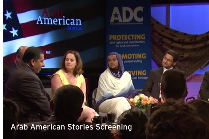
Arab American Stories Screening