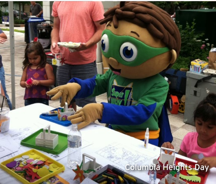
Columbia Heights Day

WHUT participated in the NBC4 Health & Fitness Expo at the Washington Convention Center. The expo is the largest free consumer health event in the country, with close to 200 exhibitors and 87,000+ attendees -- giving the station the opportunity to promote the many health and fitness, and lifestyle shows that air on WHUT, as well as our children initiatives. WHUT made sure every child attending the expo walked away with a Healthy Lifestyle bag.