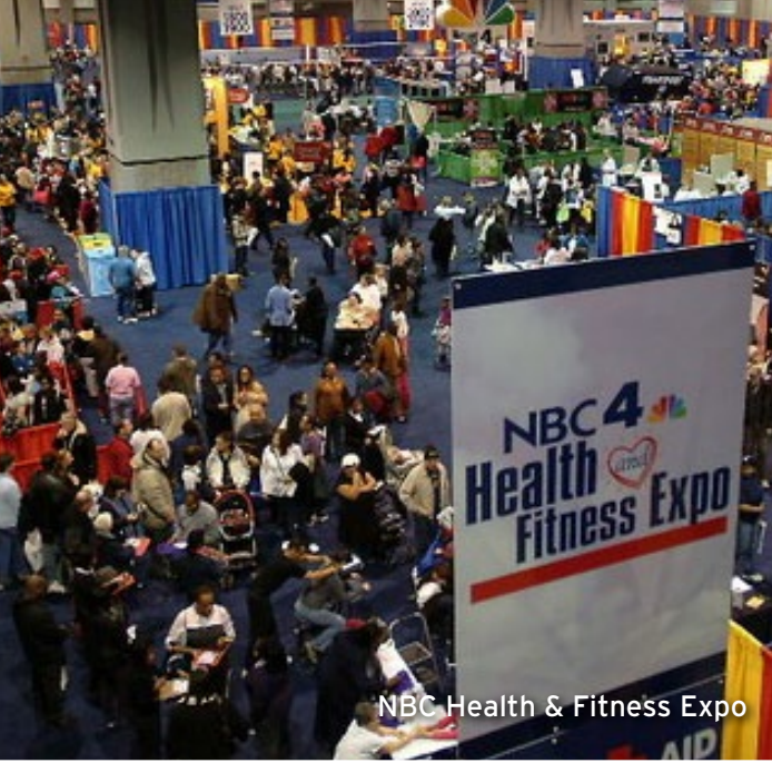
NBC Health & Fitness Expo