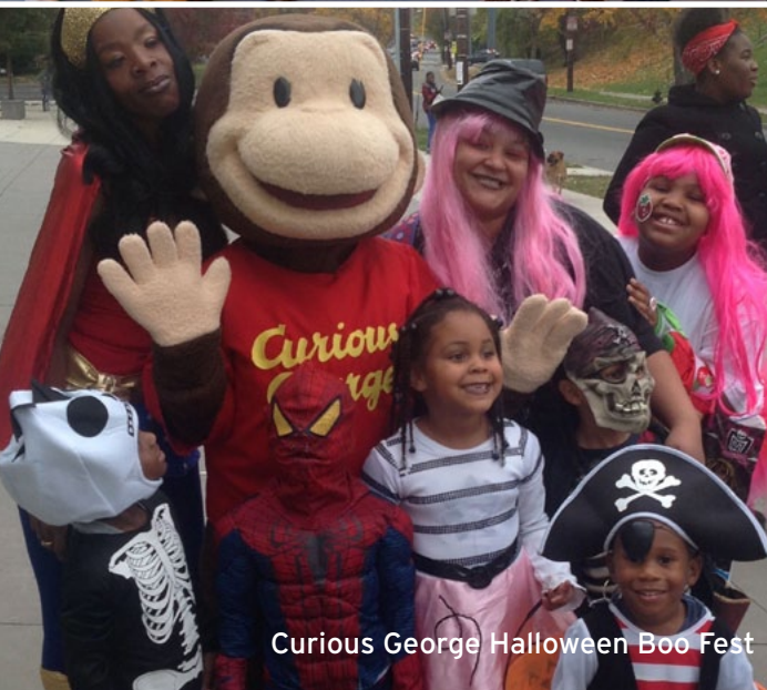
Curious George Halloween Boo Fest