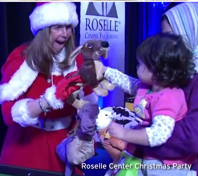
Roselle Center Christmas Party

As its giving back to the community event WHUT in conjunction with Roselle Center for Healing provided Christmas gifts and a Christmas dinner to over 120 homeless children and parents representing shelters from around the city.